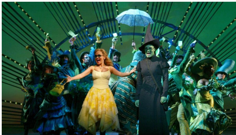
Figure 1: Glinda and Elphaba in the Emerald City 1

While on vacation in 1995, Stephen Schwartz stumbled across the book “Wicked: The Life and Times of the Wicked Witch of the West” by Gregory Maguire and saw its potential to be a musical. But Maguire had sold its rights to Universal Pictures, and they were planning on a live-action film for the book (which was later finalized by Jon M. Chu in 2024-2025 starring Ariana Grande-Butera and Cynthia Erivo). Schwartz enticed Maguire and Universal producer Marc Platt to release the rights and allow him to write a musical. Platt and David Stone later joined Schwartz in his journey of writing Wicked.